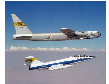
Estrella’s N824NA at work at Edwards with B-52B