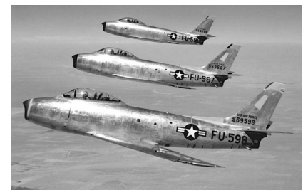
First 3 protos XP-??