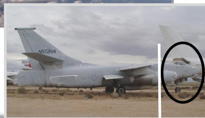
The "before" image of our "Whale". Aft portion was scrapped