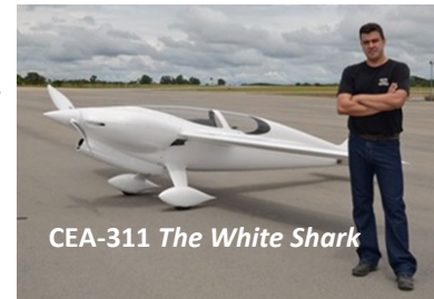
CEA-311 The White Shark