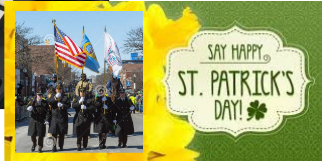
Thursday, March 17, 2022