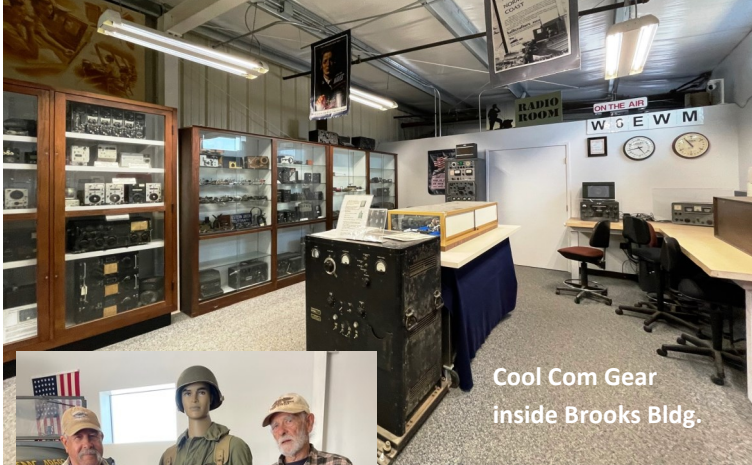
Cool Com Gear inside Brooks Bldg.