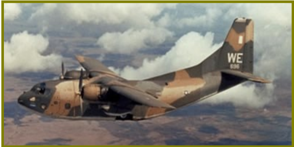
Fairchild C-123 Provider