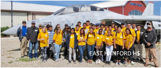
EAST HANFORD HS