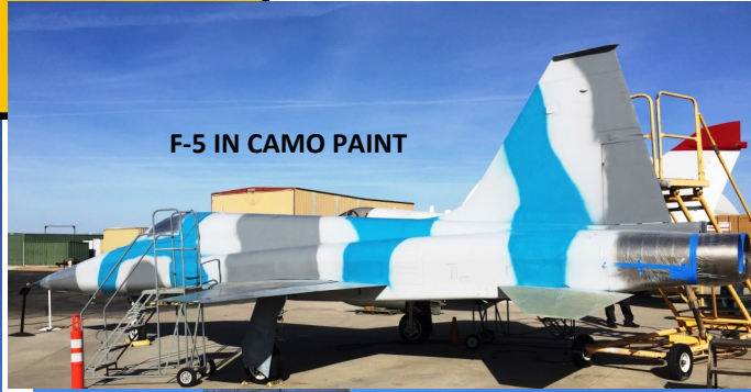
F-5 IN CAMO PAINT