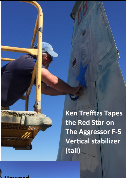
Ken Trefftz Tapes the Red Star on The Aggressor F-5 Vertical stabilizer (tail)