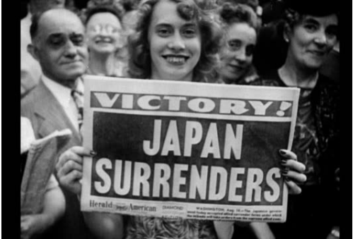
September 2, 1945