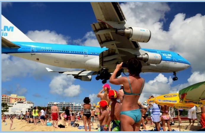
With all the roadwork, improvements, etc. going on around the Museum, this is what you can expect at PRB 2021? CMA got nothing on us!

Flying into Camarillo , as I do often in my 55-year-old Piper Cherokee, is like touching down at Disneyland— if Disneyland were wholly dedicated to general aviation. It’s not uncommon to find yourself cleared to land behind a restored World War II fighter, a home-built kitplane, a multi-million-dollar executive jet, a Cessna trainer with a young student behind the yoke, or some vaguely confused guy driving a Beech Bonanza who sounds over the radio like he’s never talked to air traffic control in his life.