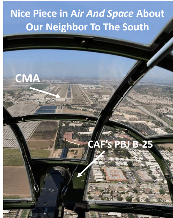
Nice Piece in Air And Space About Our Neighbor To The South