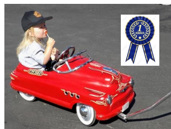
2019 Best Of Show