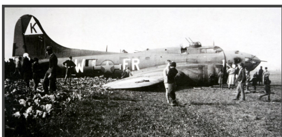
Iron Maiden at last rest stop