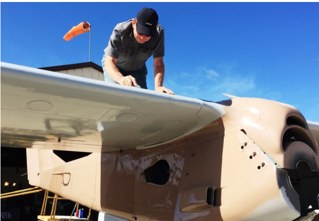
Tom Duvall preps top of OV-10 wing for new camo paint . Looks like he is attacking the OTHER side..