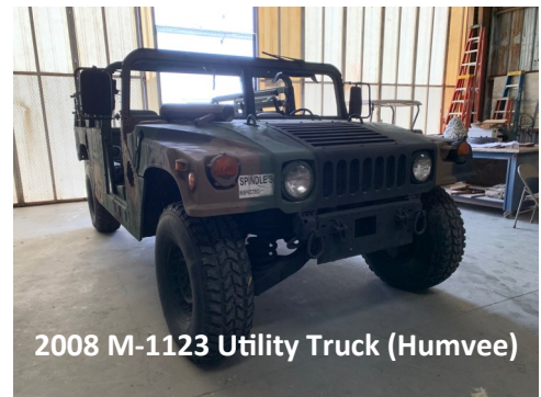
2008 M-1123 Utility Truck (Humvee)