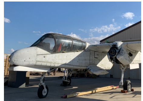
Paint-Ready: OV-10 Bronco awaits Restoration Makeup Dept.