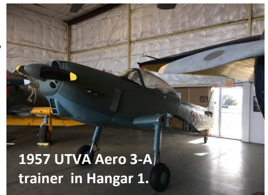
1957 UTVA Aero 3-A trainer in Hangar 1.