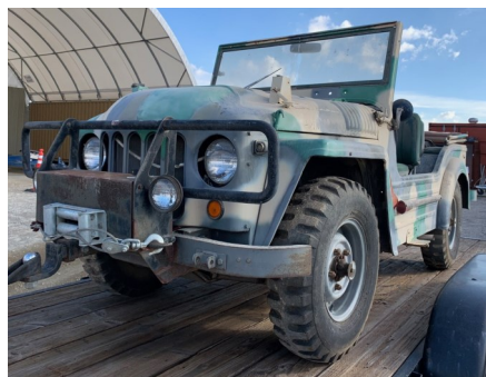
1950s Austin Champ British Army Vehicle

Restoration will make each "Parade Ready"