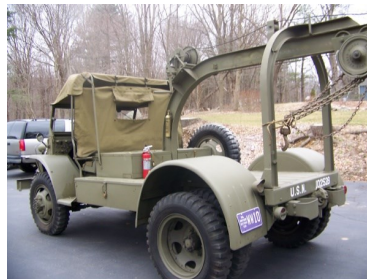
1950s Burma Jeep