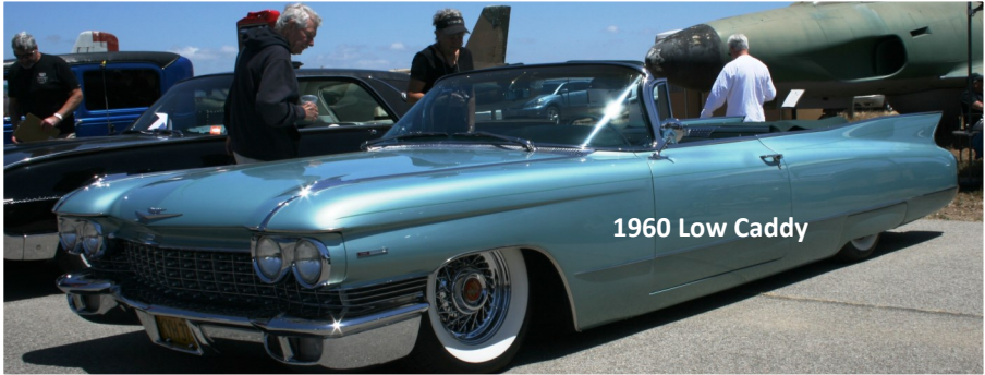
1960 Low Caddy