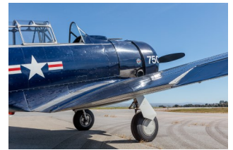
April 21, 2018