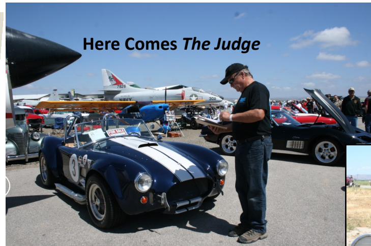
Here Comes The Judge