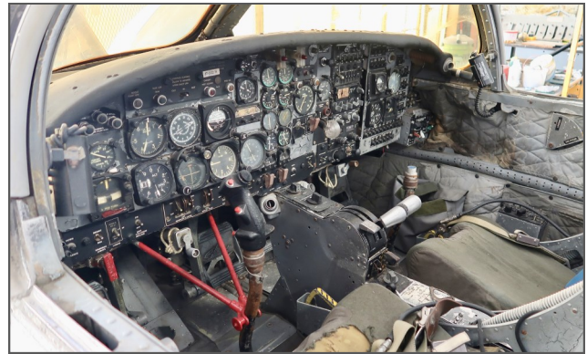
Cessna T-37 Tweet starts its makeup session in Schade Hangar. Some TLC needed and it will be perfect. Will sport RVN livery.