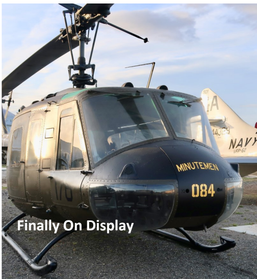
Finally On Display