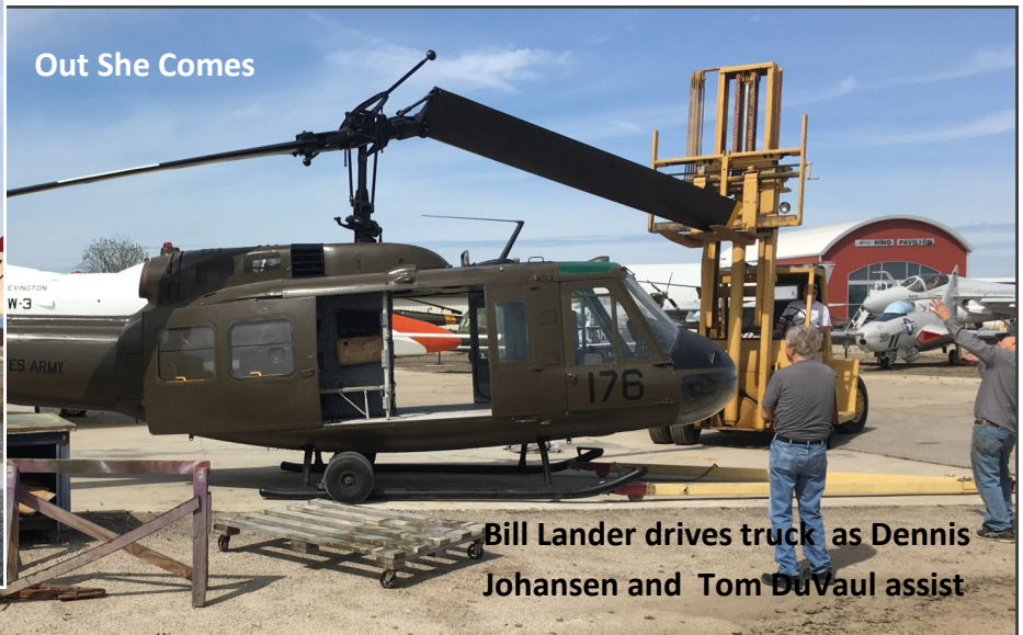
Out She Comes