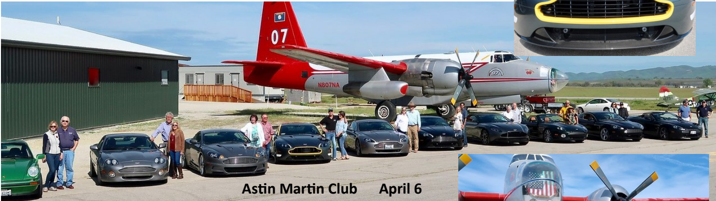
Astin Martin Club April 6