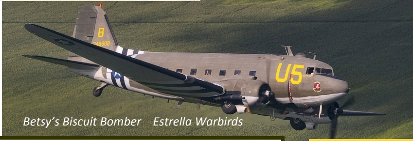
Betsy's Biscuit Bomber Estrella Warbirds