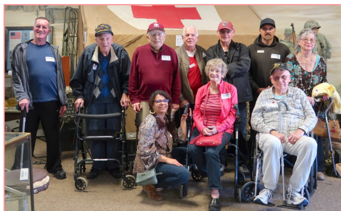
Creston Village Senior Center March 29