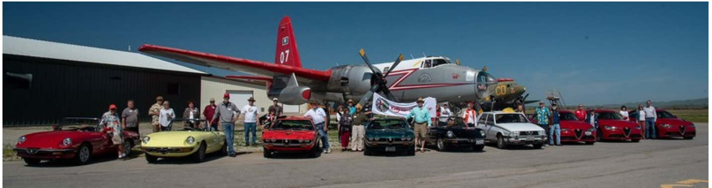
ALFA ROMEO CLUB OF SOUTHERN CALIFORNIA APRIL 12