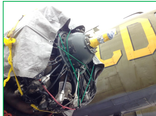
New power plant sits in its proper position on Jan 12