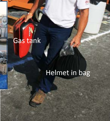
Helmet in bag