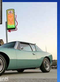
Dick's "new" Avanti