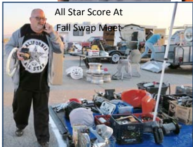
All Star Score At Fall Swap Meet