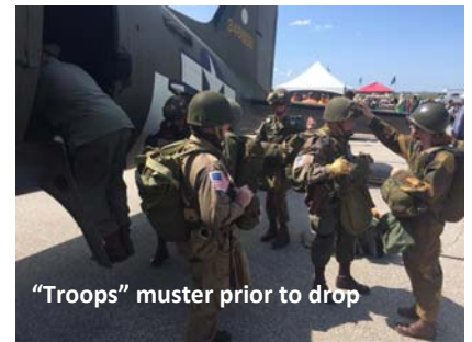
"Troops" muster prior to drop

five other examples of the classic ship on the flight line. Main event here was the largest paratroop drop since WWII, with C-47s rigged up to spill hundreds of "troops" over the