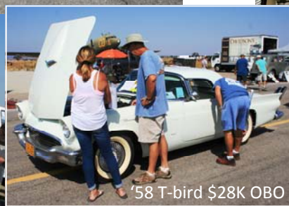
'58 T-bird $28K OBO