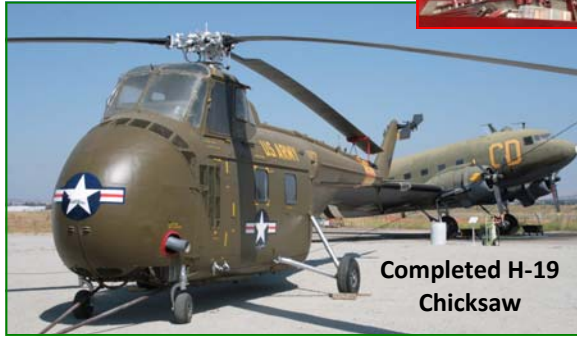
Completed H-19 Chicksaw