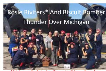
(*Many B-24s built at Willow Run)

Willow Run Airfield, Michigan- THUNDER OVER MICHIGAN 2017 , billed as the biggest air show in the State, had a partici-