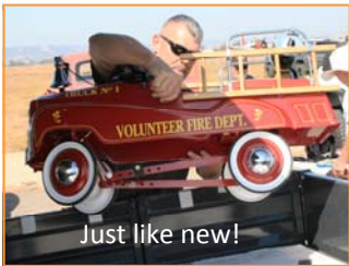
Just like new!