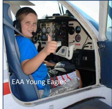
EAA Young Eagles