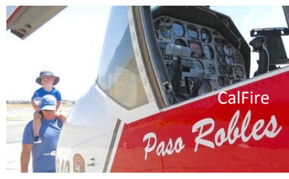
CalFire Paso Robles