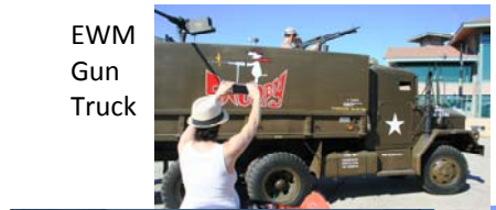
EWM Gun Truck