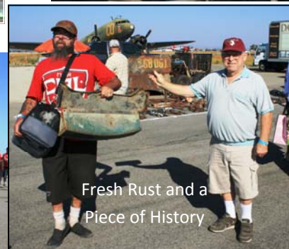
Fresh Rust and a Piece of History