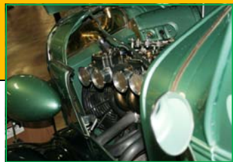
Rare '37 Chevy Off The Streets Of Paso After Long Ride