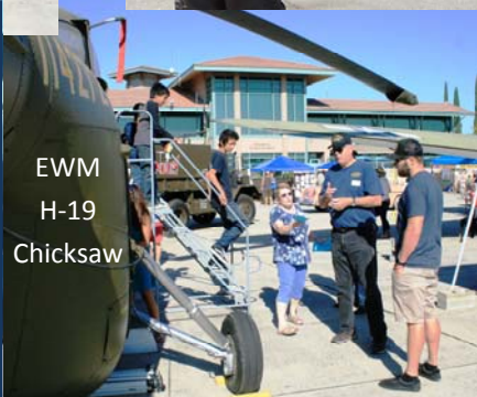
EWM H-19 Chicksaw