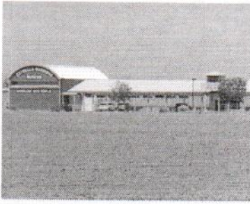
Estrella Warbirds Museum 4251 Dry Creek Road Paso Robles, CA 93446