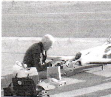
North County Cloud Clippers