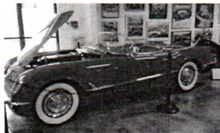
This 1954 Red Chevrolet Corvette is one of only 100 all red cars produced. These were the forerunners of todays state of the art Corvette which has been in production for over 60 years.