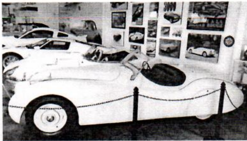
This 1951, 2 seat, white Jaguar had a top speed of 120 mph. They produced 12,055 through 1954.