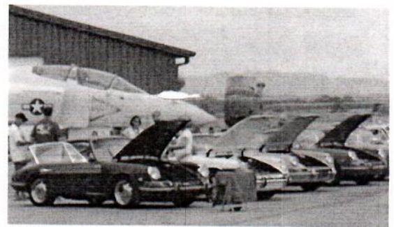
Car Show row on the runway