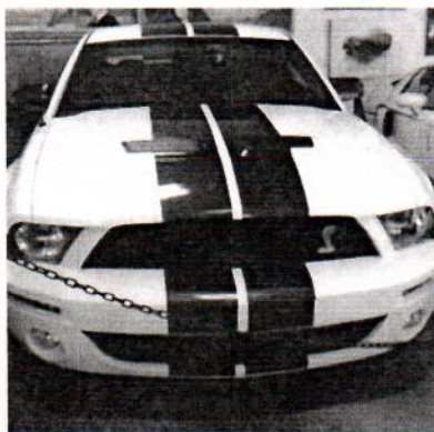
This Shelby GT500 Mustang is the "40th" Anniversary Limited Edition. Built in 2007.