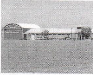
Estrella Warbirds Museum 4251 Dry Creek Road Paso Robles, CA 93446