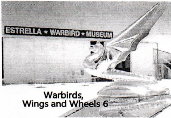
Warbirds, Wings and Wheels 6

List of Awards And Thank You's to follow next month.