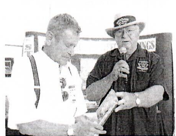
A great day was had with Bobby Unser, his car, our own pilots, planes and the classic car entrants.