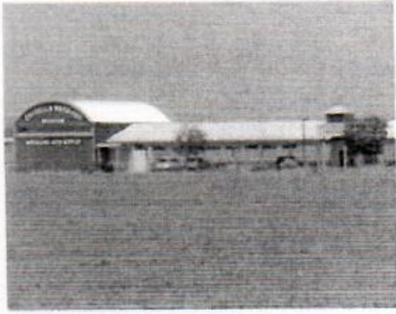
Estrella Warbirds Museum 4251 Dry Creek Road Paso Robles, CA 93446

Non Profit Org. PAID Permit 163 Paso Robles, CA 93446