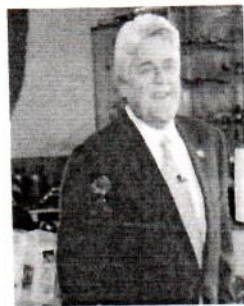
Where will you find Jay Leno in the Museum? He's here.....do you know where to find him?