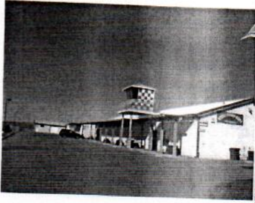
Estrella Warbirds Museum 4251 Dry Creek Road Paso Robles, CA 93446

Non Profit Org. PAID Permit 163 Paso Robles, CA 93446