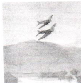
A beautiful addition to the Korean War Mural....be sure and take a look at this fine addition!