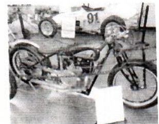
Six classic motorcycles came to us a few weeks ago. This is a 1929 Indian.....a legend motorcycle waiting to have its picture taken!