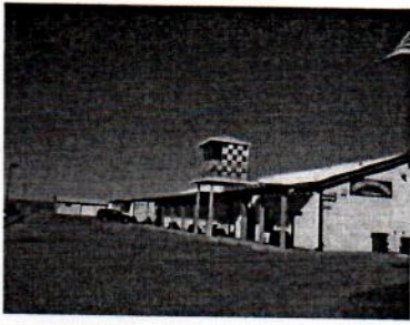
Estrella Warbirds Museum 4251 Dry Creek Road Paso Robles, CA 93446

Non Profit Org. PAID Permit 163 Paso Robles, CA 93446