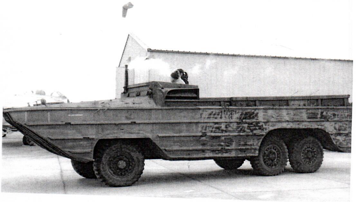
Painted on this Duck says "Iwo Jima Yacht Club"