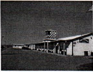
Estrella Warbirds Museum 4251 Dry Creek Road Paso Robles, CA 93446

Non Profit Org. PAID Permit 163 Paso Robles, CA 93446