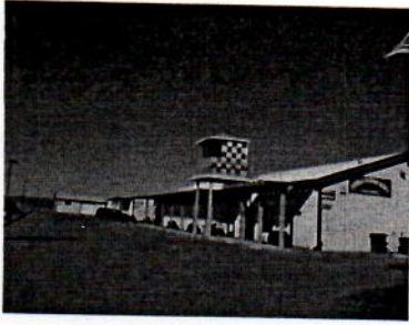
Estrella Warbirds Museum 4251 Dry Creek Road Paso Robles, CA 93446

Non Profit Org. PAID Permit 163 Paso Robles, CA 93446