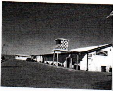
Estrella Warbird Museum 4251 Dry Creek Road Paso Robles, CA 93446

Non Profit Org. PAID Permit 163 Paso Robles, CA 93446