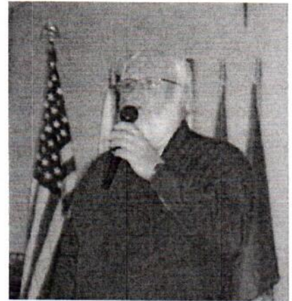
Estrella Warbirds Museum