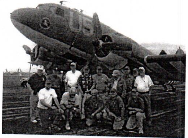
The Oshkosh Crew

Recounting this historic adventure will be members of the Flight Crew on this flight. You will hear many entertaining stories and see video and still pictures of this wonderful trip.