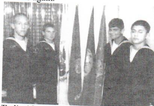
The Naval Sea Cadet program is supported by the Navy League of the United States.

We look forward to having the cadets visit us again.