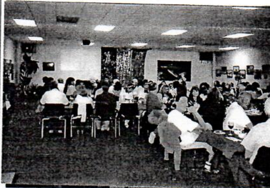
Happy Campers at IAC Banquet