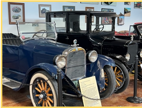
1924 Dodge Bros. Touring Car (L) and 1925 Ford Model T, New to Woodland AD in July!