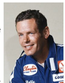
Bobby Unser 1977

facts and memorabilia which include helmets, a racing uniform, IROC, (International Race of Champions) Riverside Raceway winning jacket and checker flag. In addition, there are numerous other rare items and many beautiful photographs of the 3- time Indianapolis 500 winner.