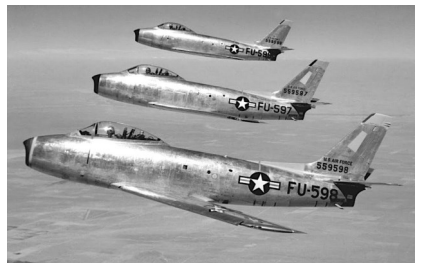
First 3 protos XP-??