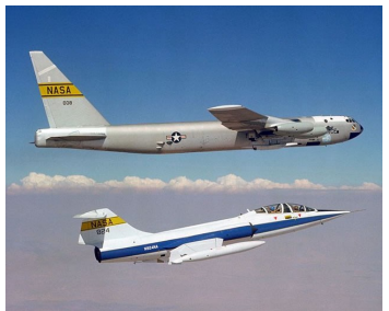
Estrella's N824NA at work at Edwards with B-52B