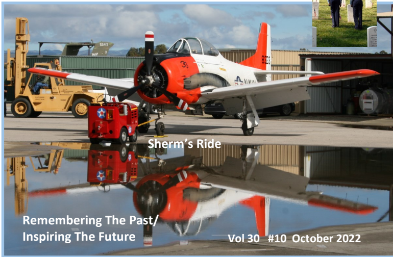
Remembering The Past/ Inspiring The Future