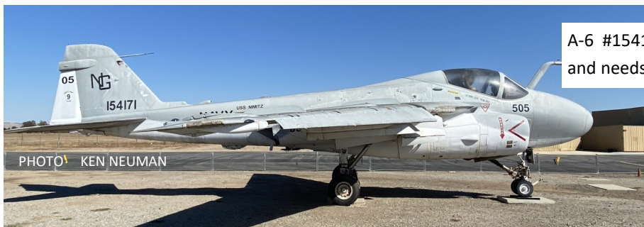
A-6 #154171 Intruder came to Estrella in 1996 and needs some Resto TLC. . .It will happen.

I do hope to restore the A-6 but unless we can get the wings to fold, it is too big to fit in the hanger....will have to work on that. "