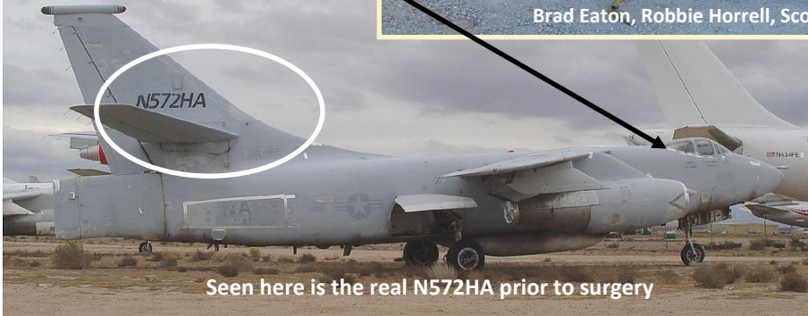
Seen here is the real N572HA prior to surgery